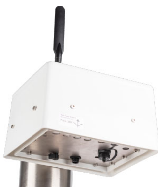
Pro version (Praxis/Urban)