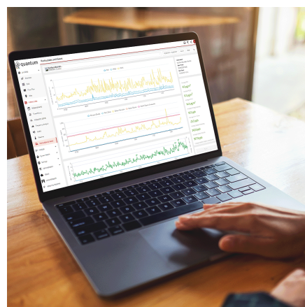
Access your data via the Quantum Cloud, 24/7 on any device