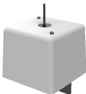
Standard version (Praxis/OPCube)