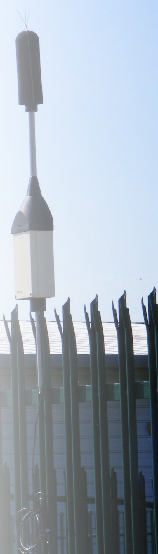
Wall mounting using the optional CM:427 Kit